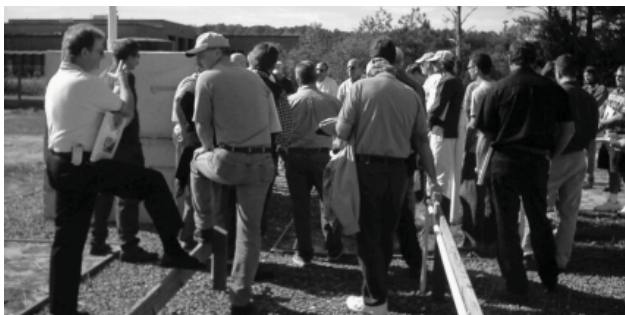
Hands-on training at Delaware Tech's onsite lab.