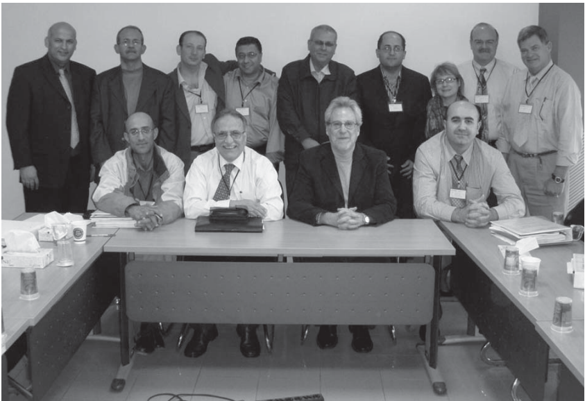
Jordanian Water/Wastewater Working Group, Amaan, Jordan.