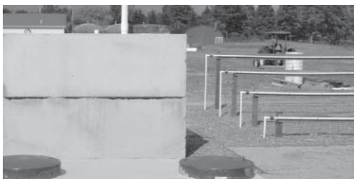
Onsite systems at the Environmental Training Center.