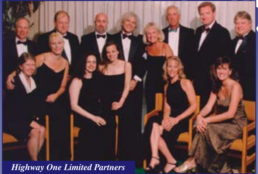
Highway One Limited Partners