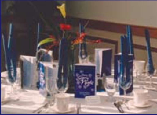
The table look ...