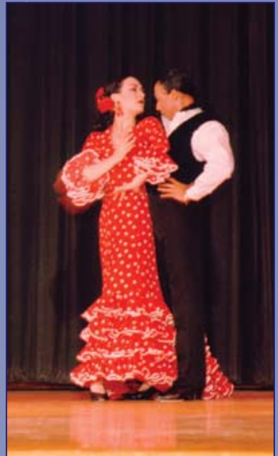
Members of Arte Flamenco