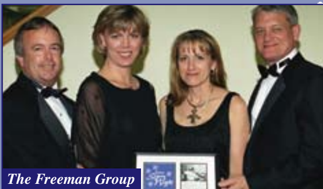
The Freeman Group