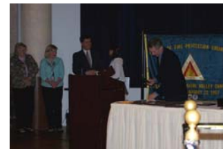
Scholarship Committee handing out a scholarship award at the annual meeting.