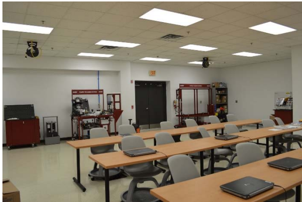
New 1200sf classroom & laboratory