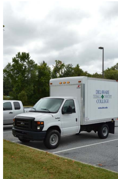
Ability to bring workforce training onsite